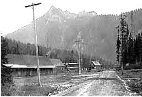
Sunset Highway through Snoqualmie Pass is dedicated on July 1, 1915.

Long before Interstate 90, before U.S. Highway 10, even before the Lake Washington floating bridge, there was the Sunset Highway. It was the main east/west route from Seattle to Spokane and beyond from about 1914 to 1940, snaking through many small towns and communities along the way.