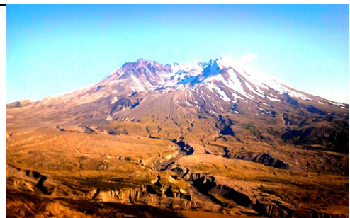
Picture after the eruption.

Lunch BYO (bring your own) for a picnic at Mt. St. Helens