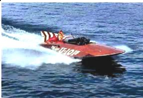
inahoo, U-101 S, Lake Mead, 1959 Hydroplane History <http://www.lesfield.com>

Wine lovers! Gear heads! Nostalgics! Do you like vintage wooden boats, vintage unlimited hydroplanes, and Chelan area wines? How about staying at a premium Chelan waterfront resort for a bargain price? This is the PSMC event for you.