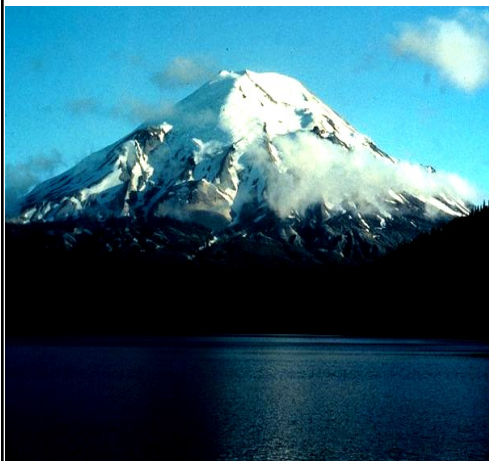
Picture before the eruption.

At 9:00 am we will depart taking Hwy 7 (south) for 30 miles through the town of Elbe then take a right over bridge continuing 17 miles on Hwy 7 to the town of Morton.