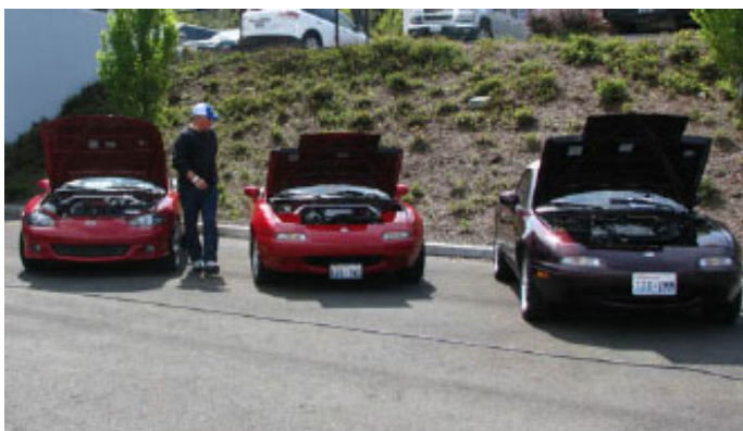
Around 25 cars participated in the judging for the Detailin' Day Show n Shine event. Here are three Miatas ready for judging now

Please keep an eye on the PSMC website for details as they get firmed up!