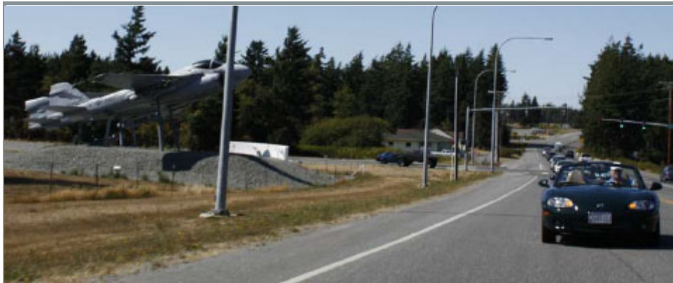
This photo of the entry point to Whidbey Air Station from last year's drive is just one sighting of mounted aircraft on the Island. This drive will present a great chance to enjoy some top down summertime driving.

The tentative plans are to stop at Fort Casey State Park to observe the WWI and WWII gun emplacements which protected Washington from enemy ships and submarines. Our travels will also