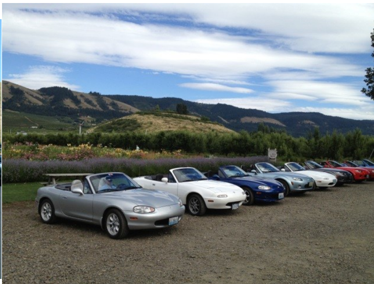
“Lavender Fields Forever”