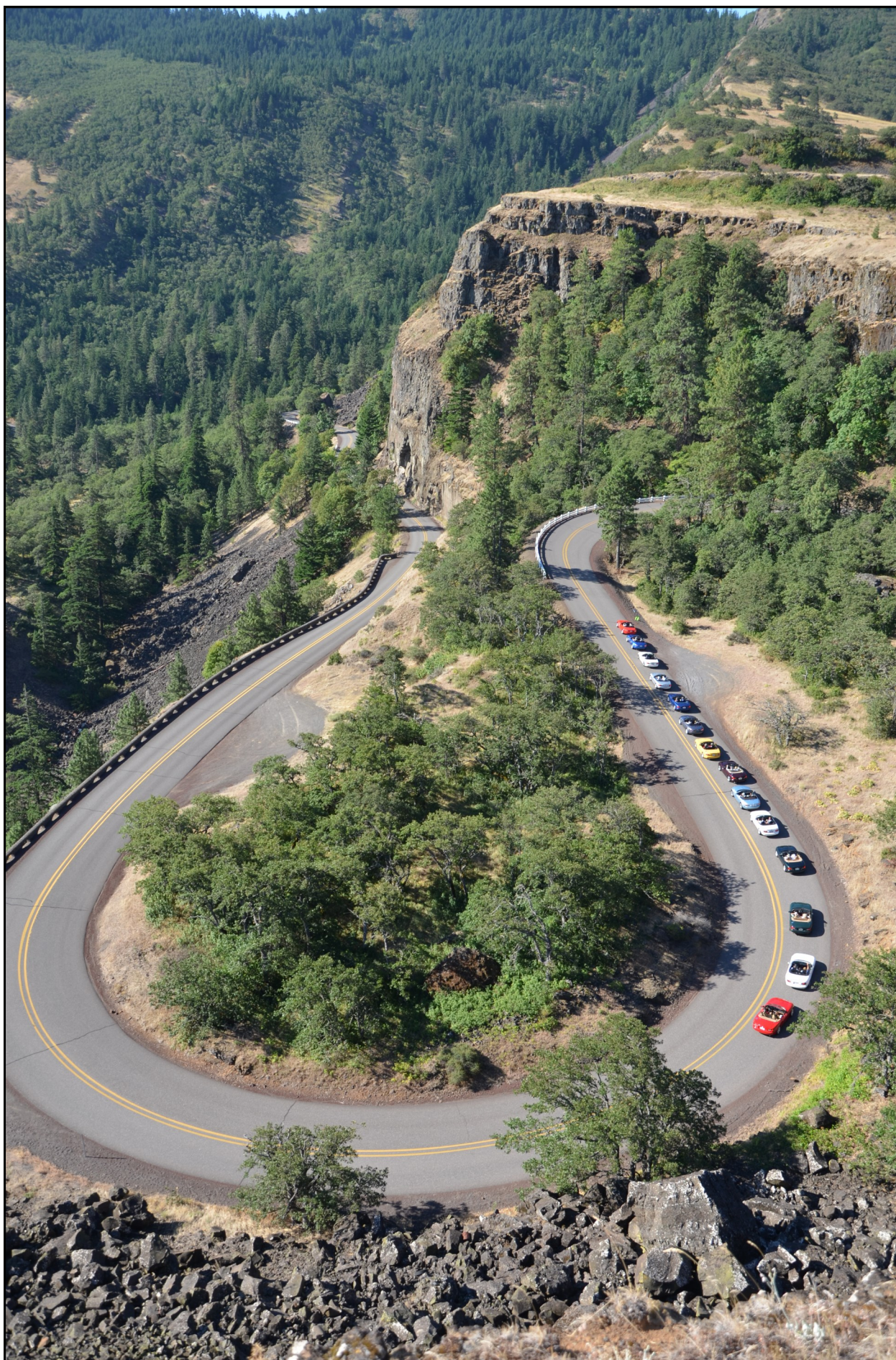
Left: Miatas climbing Rowena Curves on Columbia River Highway.