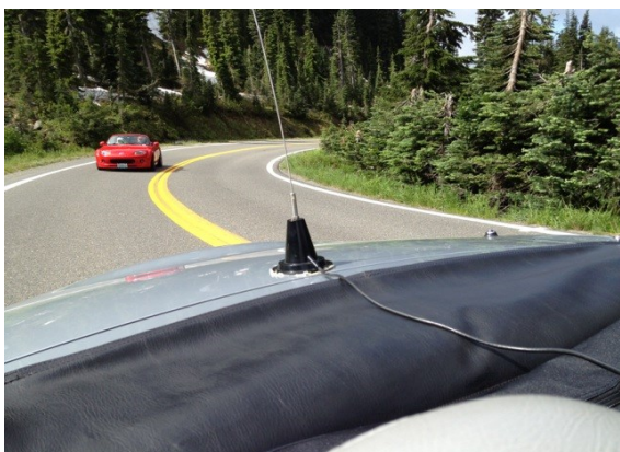
Left: Maury-n-Sandy zooming up Chinook Pass (elev. 5432 ft.)