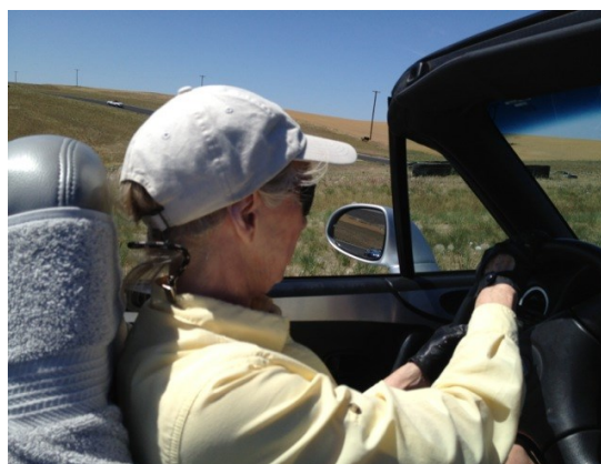
Right: Oregon Raceway Park, “Cornering on the door handles.”