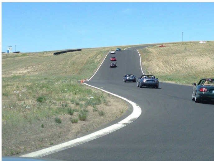
Miatas lapping at Oregon Raceway Park