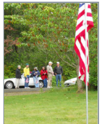
Waiting for the program to begin, PSMC members come up with a plan of action to view the flags and events at the Vaughn Cemetery May 30.