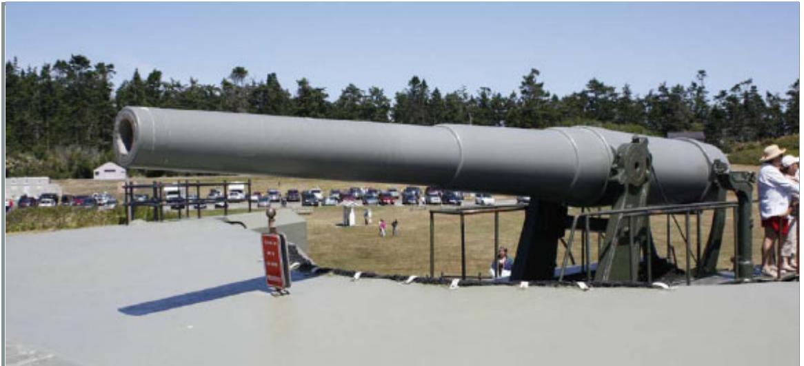
Camp Casey was an active military base at one time and many remnants of the base remain for further exploration by visitors. This is a photo from last year's tour, which features an old cannon on permanent display on the grounds. Look closely and you can see the Miatas parked in the background.

We will be traveling on roads lesser driven on our trek to North Whidbey. You will have the opportunity to see the impressive beauty of the north end of Puget Sound, Admiralty Inlet, Saratoga Passage, Useless Bay, Holmes Harbor, Penn Cove (Home of the Penn Cove mussel farm) as well as narrow tree-lined roads. Enjoying sights of wildlife will also be a