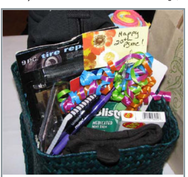
The centerpieces at the 20th Anniversary party were a bit unusual, but much appreciated. They featured a basket full of essentials that every Miata owner should have in the trunk to be prepared for any emergency. These were given away at the end of the program.