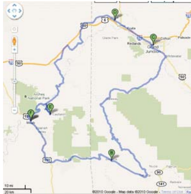
Miatas in Moab Run

We went back to the Canyonlands Inn to change clothes, and to buy some Miata goodies. Thompson Automotive showed up with Miata Hawaiian Shirts, and those were easily the most popular of all the Miata-themed merchandise. The first time I wore mine at a PSMC event, I was inundated with questions as to where I got it. Here's a link to where you can get your own: http://www.thompson-automotive.com/Shirts.html