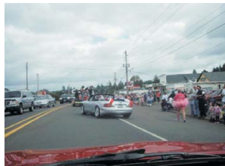
Oh, the sights you see at a parade!