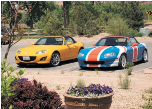
How people love their Miatas!

STAY TUNED FOR PART III IN THE NEXT ISSUE!