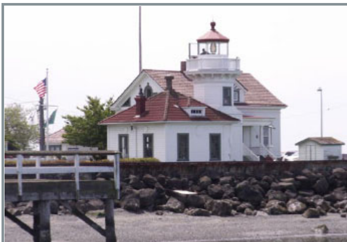
Beautiful scenery, like this cool building along the waterfront, abounds on Whidbey Island, where you will get to see many less-traveled roads and some bald eagle nests along the way.

As mentioned earlier, this wonderful ride is still under construction and there will be more specifics to follow as the date draws near.