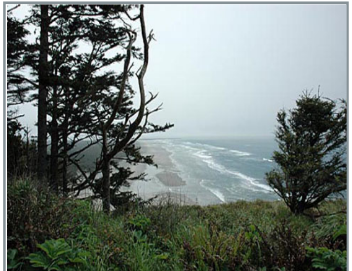
Looking toward Cape Disappointment, the scenery is truly spectacular on the 2009 Beach Party Run.