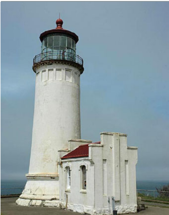
The North Head Lighthouse near Long Beach is one of several scenic outposts along the Pacific Coast scheduled for the Beach Party Run.

After you RSVP on the website, please send an email to us for a complete itinerary with times & route map and let us know when you'll be joining us.