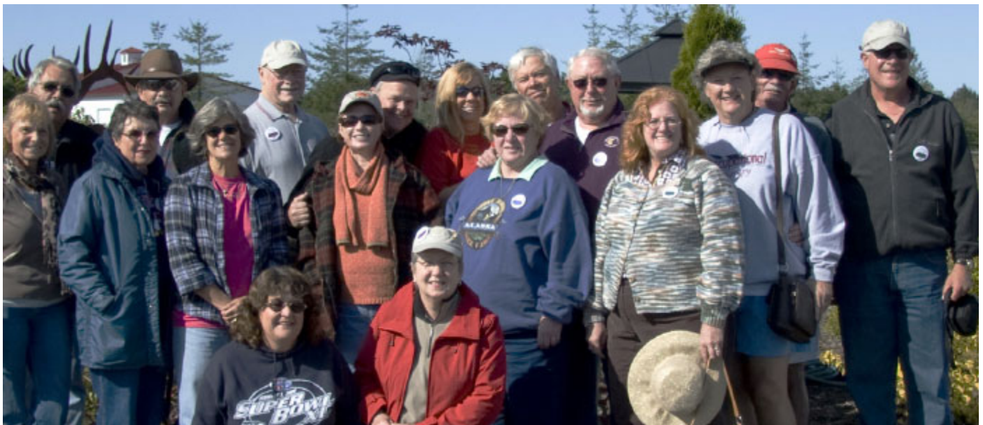
The group on the Olympic Peninsula Tour paused for a photo at Westport Winery on Oct 4.

We departed company with superb experiences to add to our memory banks, the kind that cause us to pause and say, "Do you remember when...", and to see what is in store for the next year of the PSMC.