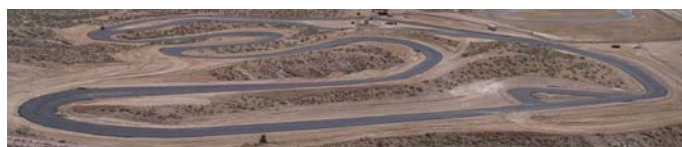
Horse Thief Mile.