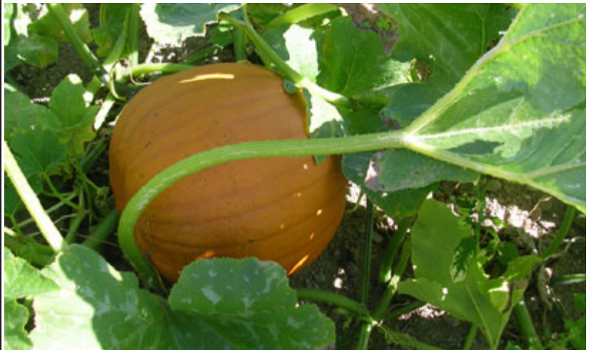
The Pumpkin Patch at Carpenito Brothers

Directions to Gene Coulon Park from I-405: From the North, take the Sunset/Park St Exit, go right at the end of the exit ramp; take the first right turn and follow the road around to the main entrance to the park. Meet at the picnic tables near Kidd Valley Burgers. From the South: Take the Sunset/Park St. exit; turn left at the end of the off-ramp. Turn right at the second light and follow the road around to the main entrance; meet at the picnic tables near Kidd Valley Burgers.