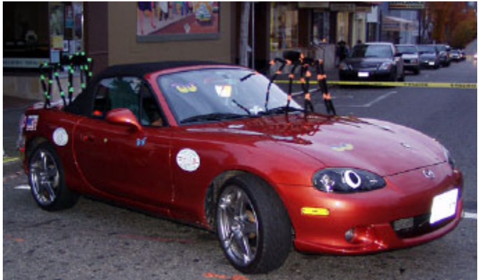
Here's one of the Miatas decorated for the Safe Trick Or Treat at last year's event in Bremmerton.